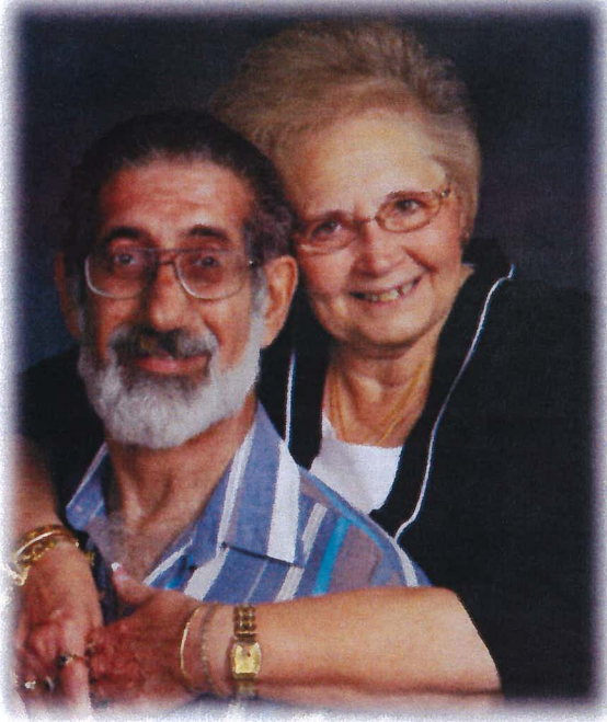
Herman H. Lohmeyer Funeral Home 500 E. Walnut Street, Springfield, Missouri 65806