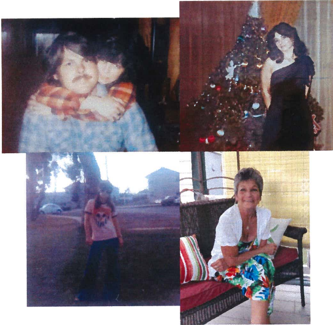
Herman H. Lohmeyer Funeral Home 500 E. Walnut Street Springfield, Missouri 65806 417-862-4433