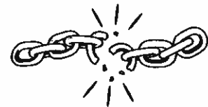
The Broken Chain

We little knew that day, God was going to call your name. In life we loved you dearly, In death, we do the same. It broke our hearts to lose you. You did not go alone. For part of us went with you, The day God called you home. You left us beautiful memories, Your love is still our guide. And although we cannot see you, You are always at our side. Our family chain is broken, And nothing seems the same, But as God calls us one by one, The chain will link again.