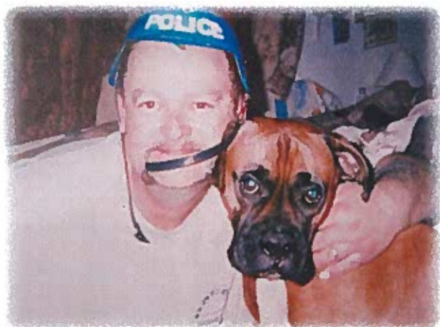
Herman H. Lohmeyer Funeral Home 500 E. Walnut Street