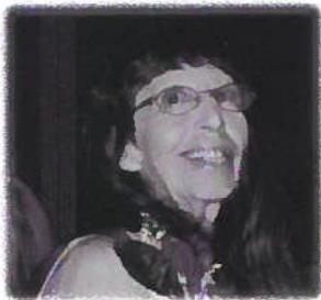
The Twenty-Third Psalm

The Lord is my shepherd, I shall not want. He maketh me to lie down in green pastures. He leadeth me beside the still waters. He restoreth my soul. He leadeth me in the paths of righteousness for His name's sake. Yea, though I walk through the valley of the shadow of death, I will fear no evil; for Thou art with me, Thy rod and Thy staff they comfort me. Thou preparest a table before me in the presence of mine enemies. Thou anointest my head with oil; my cup runneth over. Surely goodness and mercy shall follow me all the days of my life; and I shall dwell in the house of the Lord forever.